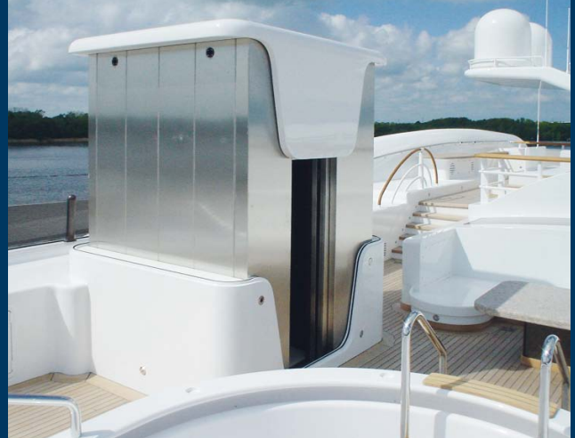
James Bond Style Elevator (Megayacht)