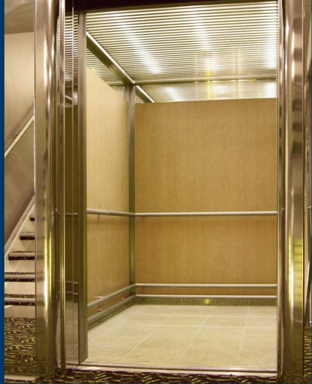
Passenger Elevator (Pont-Aven)