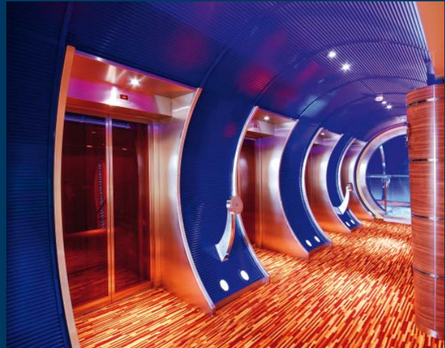
Passenger Elevator (AIDAdiva)