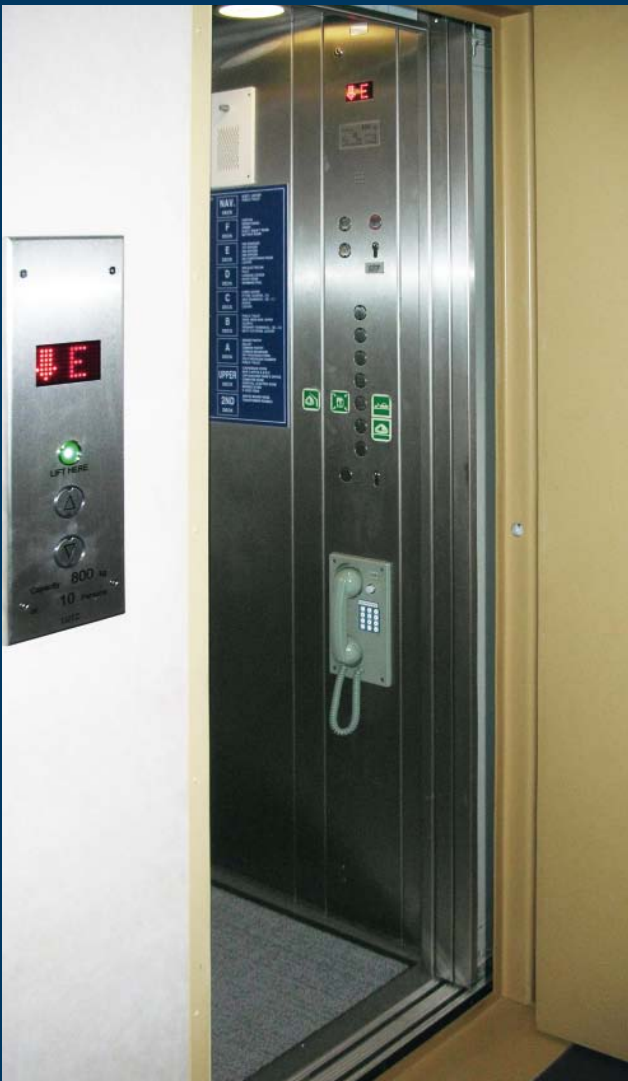
Cabin Entrance (Colombo Express)