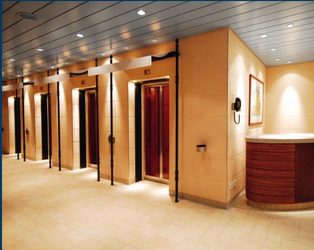
Passenger Elevator (AIDAdiva)