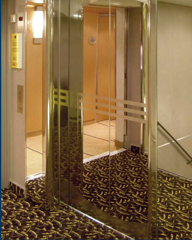
Passenger Elevator (Pont-Aven)