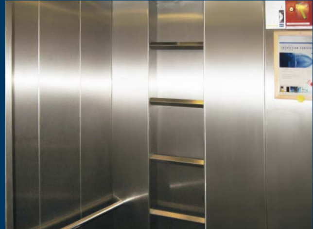
Escape Ladder (Eleonora Maersk)