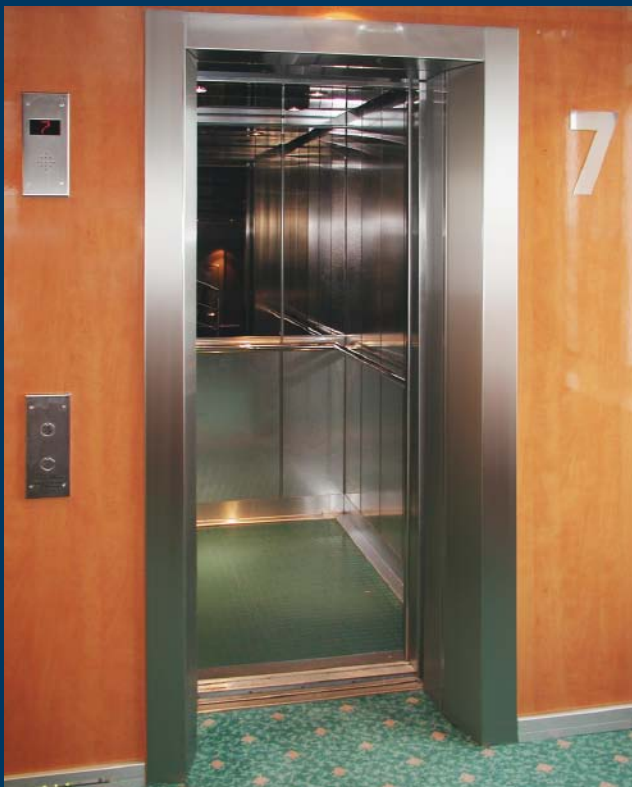
Service Elevator (Nils Holgersson)