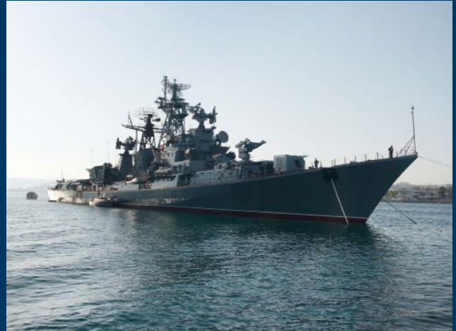
Joint Support Ship