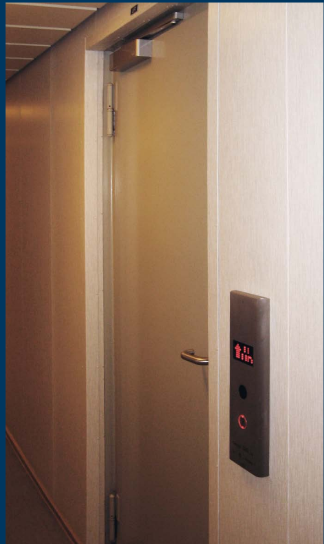
Landing Door (Eleonora Maersk)