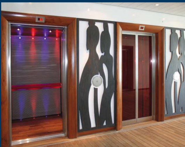
Passenger Elevator (AIDAbella)