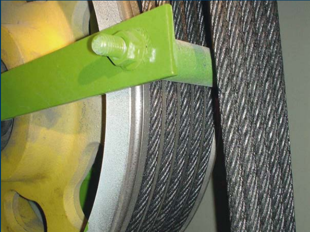
Wire Rope (Colombo Express)