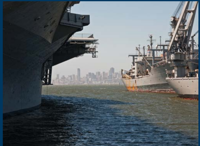
Joint Support Ship