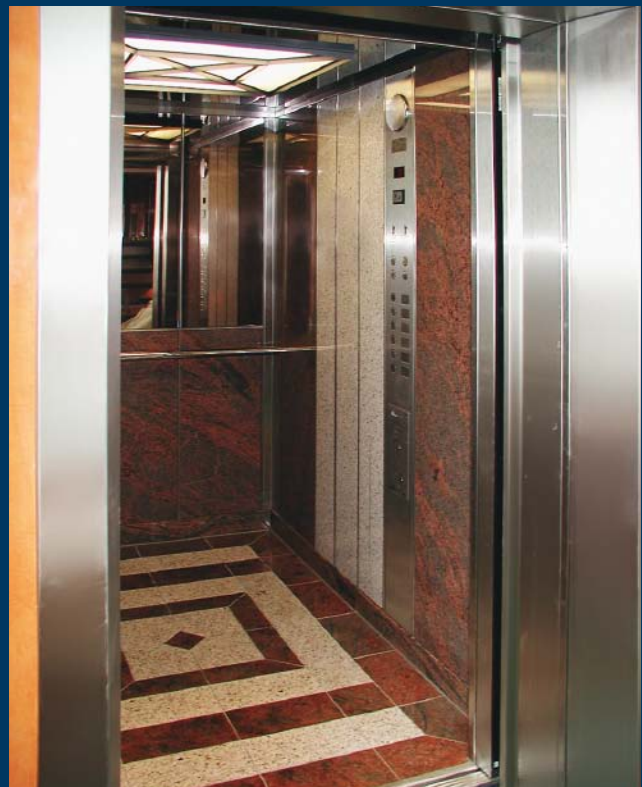
Passenger Elevator (Nils Holgersson)