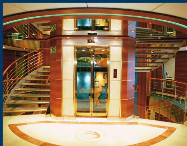
Panoramic Elevator (Cruiser Orion)