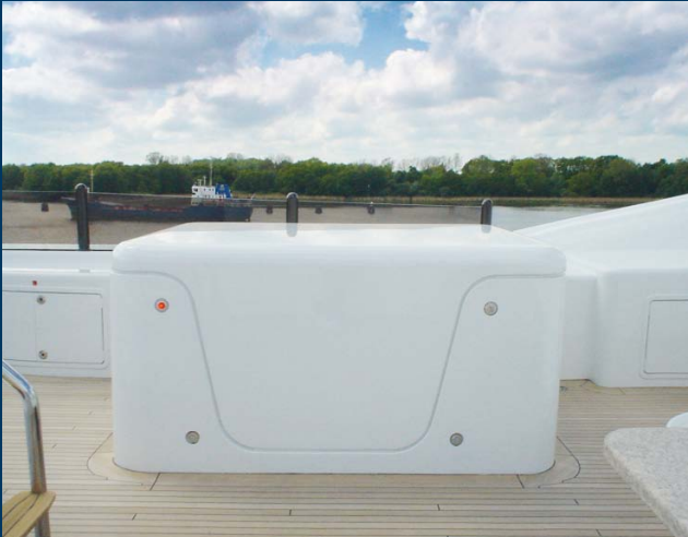
James Bond Style Elevator (Megayacht)