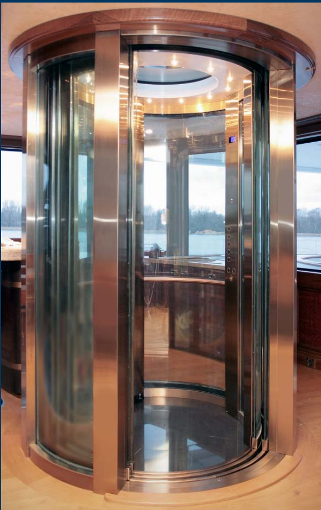
Circular Glass Elevator (Megayacht)