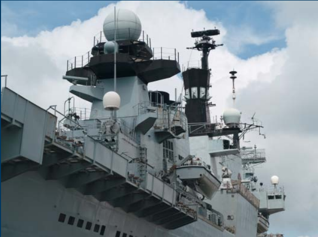
Joint Support Ship