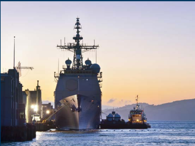
Joint Support Ship