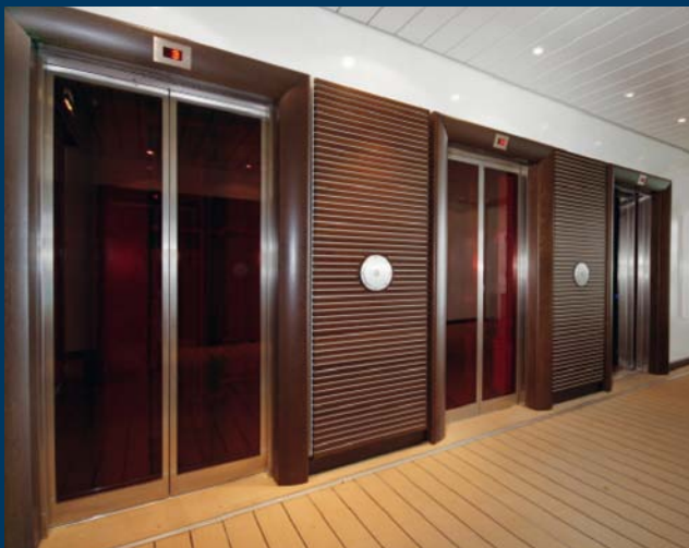
Passenger Elevator (AIDAblu)